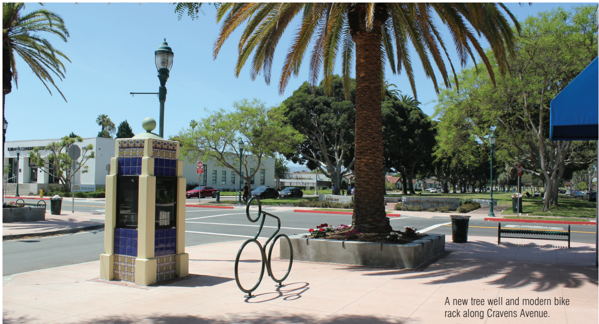
A new tree well and modern bike rack along Cravens Avenue.

W hen the City of Torrance, Calif., decided it was time for a facelift to a section of Cravens Avenue in the historic downtown area, it was much more than a simple repaving project. The area, affectionately known as “Old Torrance,” was designed in 1912 by Frederick Law Olmsted, Jr., making the street more than 100 years old. There also were significant sidewalk issues that presented safety hazards, so it was time for a major refresh. The city’s vision was to create an “inviting and more unified