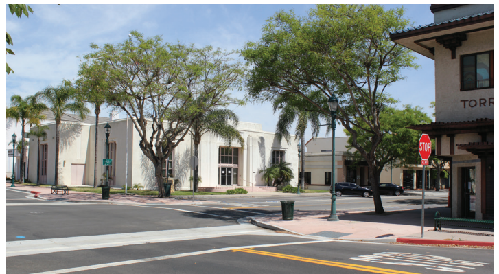
Improvements to pedestrian walkways, ensuring safety while maintaining the town's charm.