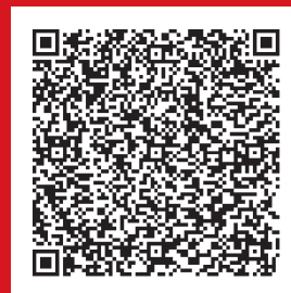
MicroStation Free Trial